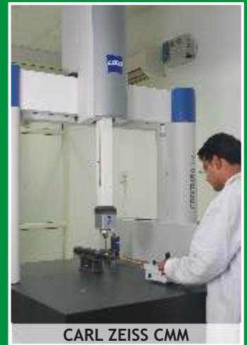
CARL ZEISS CMM