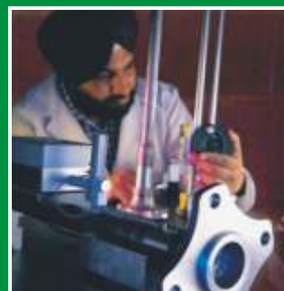
Surface Roughness Tester