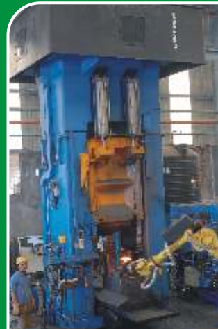
Direct Drive Screw Press