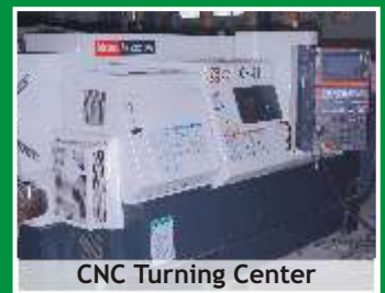
CNC Turning Center